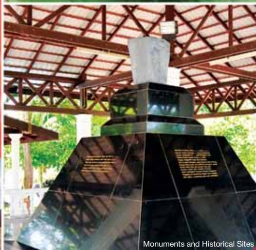
Monuments and Historical Sites